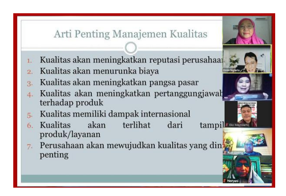
Figure 1. Implementation of Activities